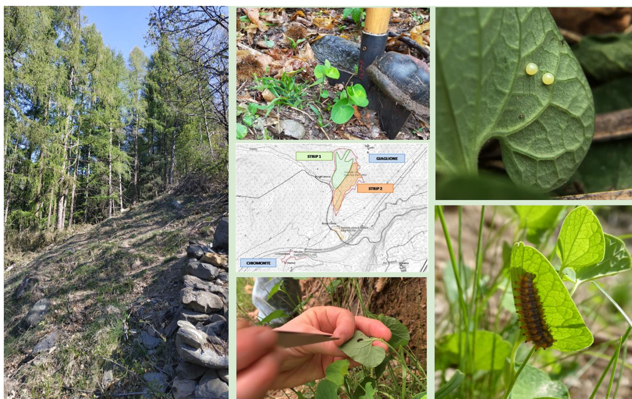
Figure 3. Images of the ecological corridor, and the translocation of host plants ( A. pallida ) and Z. polyxena larvae. The map shows the area where the ecological corridor was located (Strip 1; 10 ha), and an area with thinning and selective cutting (Strip 2; 40 ha).

In addition to creating the clearings, the plan included forest improvements, such as thinning and selective cutting in about 40 ha in the surrounding area of the corridor. In order to compensate for the loss of old trees, forest aging interventions and artificial bat roost installations were planned for at least 30 trees in forest and forest margins surrounding the expansion site. In particular, two artificial holes were produced in the trunk of broad-leaved trees—and also some conifers—with a diameter of greater than 40 cm (Figure 4). Bat boxes (a wooden Kent double-chambered box and a Schwegler 2F woodcrate box) were installed in the same trees to increase roosting sites—and to compare the usefulness of artificial holes in respect to bat boxes; and a black corrugated fiberglass panel was fixed around the trunk to produce artificial cavities similar to cracks in the cortex. While wooden bat boxes are known to be mostly used by Pipistrellus species [58,59], Schwegler bat boxes can also be occupied by Myotis , Nyctalus , and Plecotus species [60–63]. Artificial roost orientation was varied in order to ensure greater heterogeneity, also based on thermodynamic conditions [64]. By differentiating artificial roost type and orientation, we therefore aimed at improving suitability for different bat species. In 2020, 30 trees were provided with artificial cavities and nest-boxes.