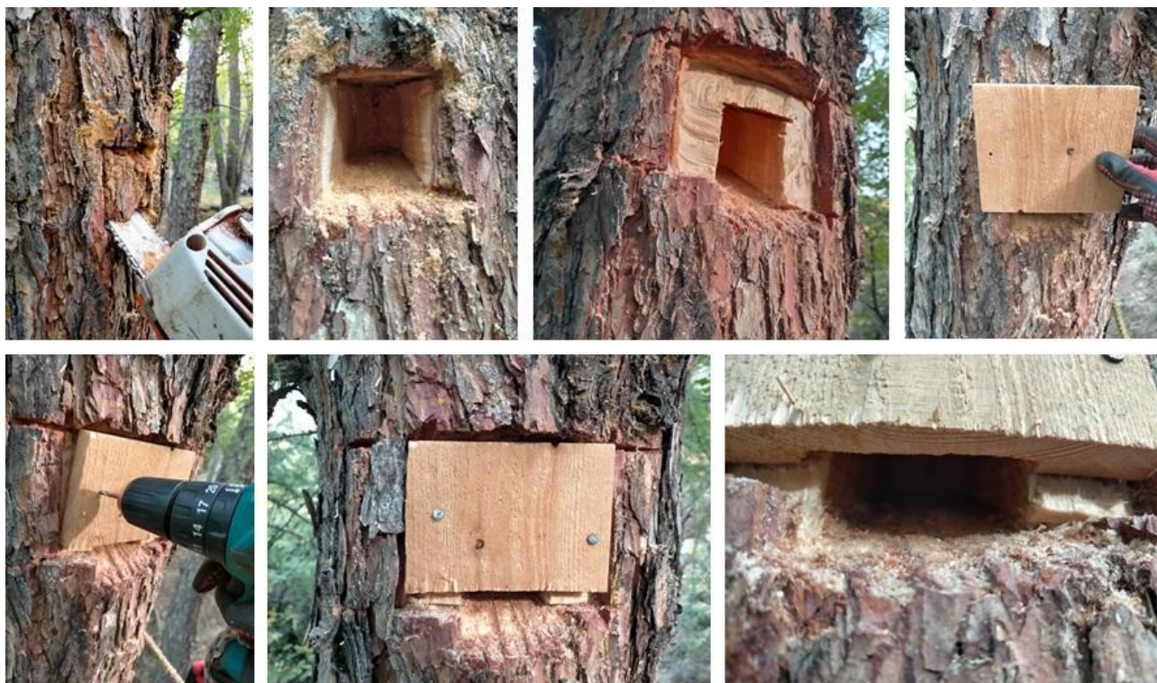
Figure 4. Successive phases of making artificial holes for bats in tree trunks. An experienced forest climber drills a large hole with the help of a chainsaw. The opening is then narrowed with a wooden rod to create a smaller entrance favorable to bats.